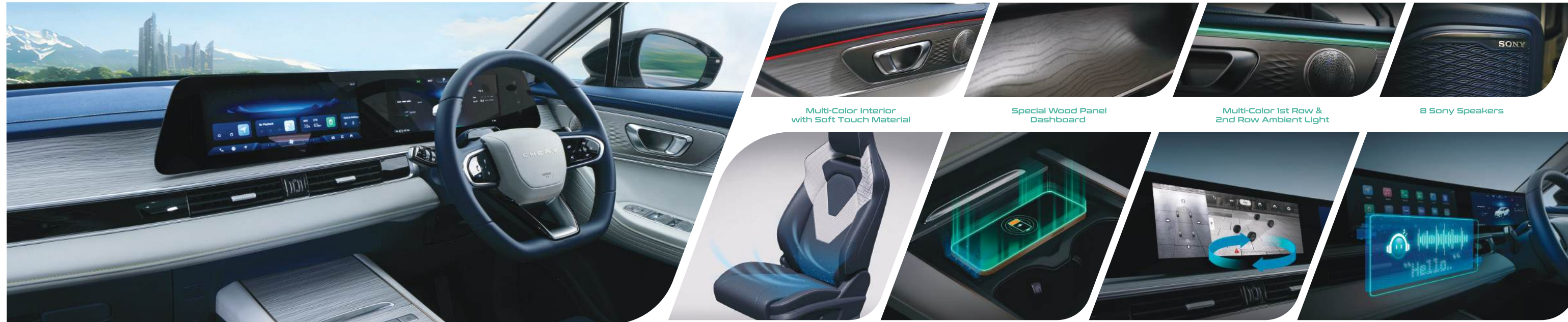
Futuristic Cabin with 24,6 inch Super Large Curved Screen