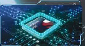
Advanced Driving System With Qualcomm B155 Chip