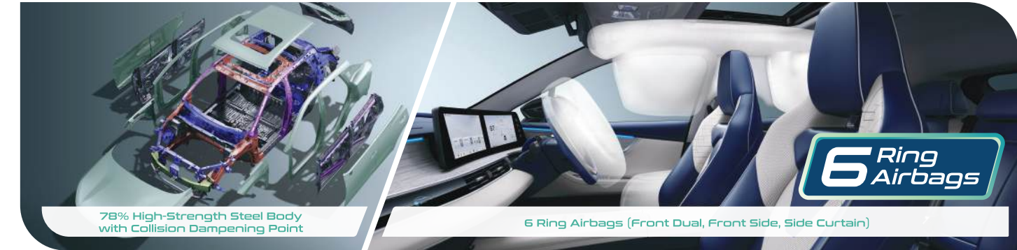
78% High-Strength Steel Body with Collision Dampening Point