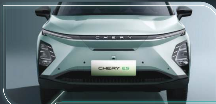
X Future Tech Front