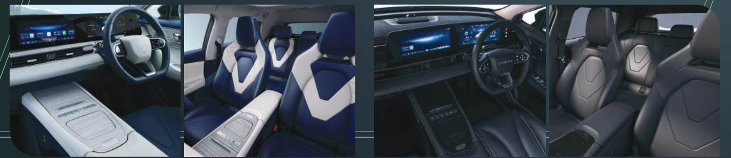
Saint Cyrillus Blue + Streamlined Beige (Omoda E5 only)