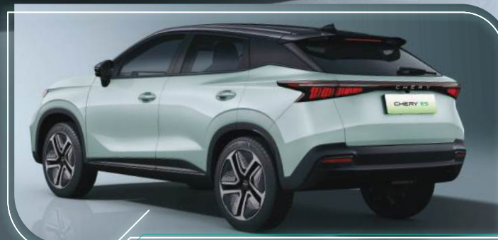
Light & Shadow Streamline Body