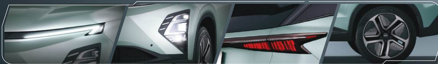
LED DRL Daytime Running Lamp